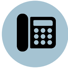
IP Phone Systems